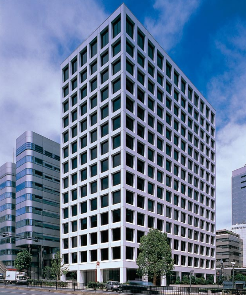
Above: Head Office