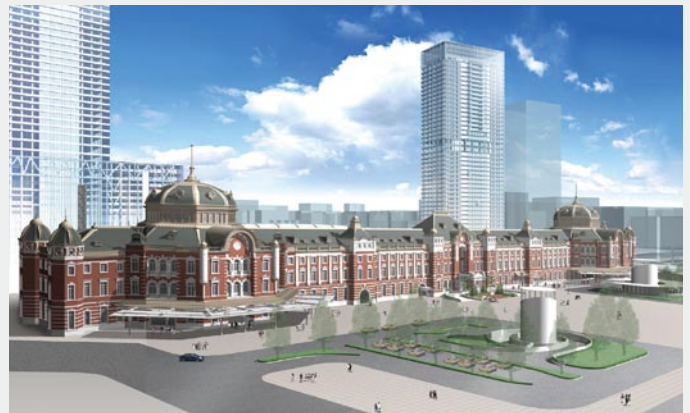
Rendering of the completed station, with the redeveloped buildings in Yaesu in the background

Several redevelopment projects are currently underway in the area around Tokyo Station, with a joint venture including Kajima developing two high-rise buildings on the opposite Yaesu exit side. The restoration of Tokyo Station will ensure that this cultural asset and historic building remains for future generations, and will create a stately urban space for the capital city.