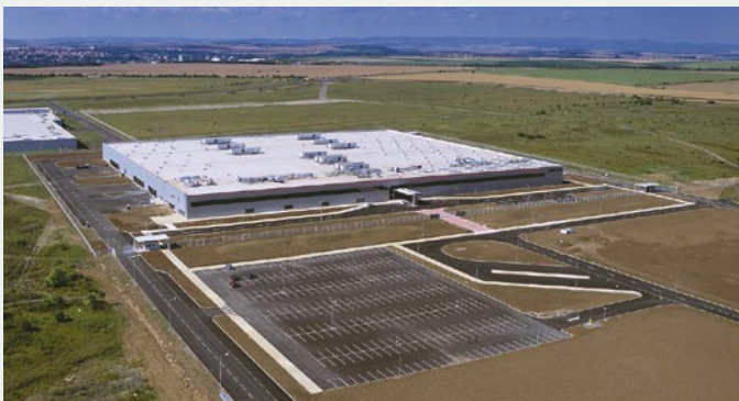
The television final assembly and plasma display module plants

Kajima has built a new production plant for Hitachi Home Electronics (Czech), s.r.o. in the Industrial Zone Triangle city of Zatec in the Usti region of the Czech Republic. The new factory will help meet the rapidly growing demand for flat-screen televisions driven by the wide-spreading Digital Terrestrial Television (DTT) broadcasting in Europe. This is Hitachi's first production plant for flat-screen televisions (plasma and LCD) in Europe.