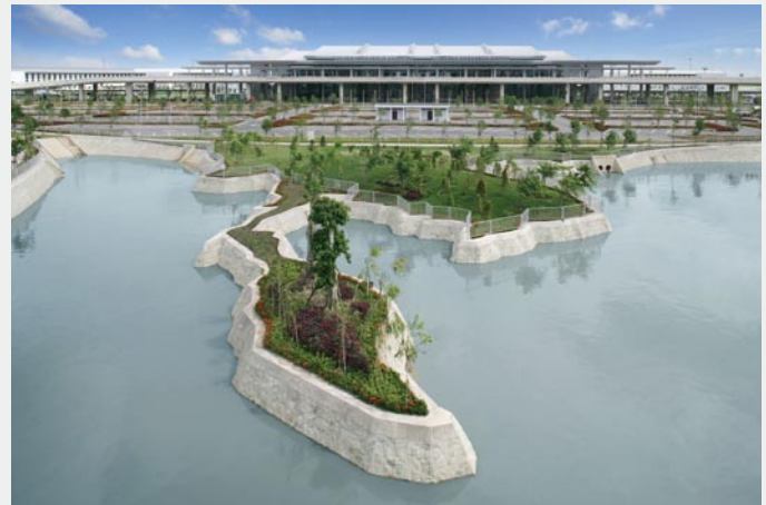
Water and greenery surround the terminal building

The completion of the new airport terminal raises expectations for the further sustainable economic development of Ho Chi Minh City and Vietnam.