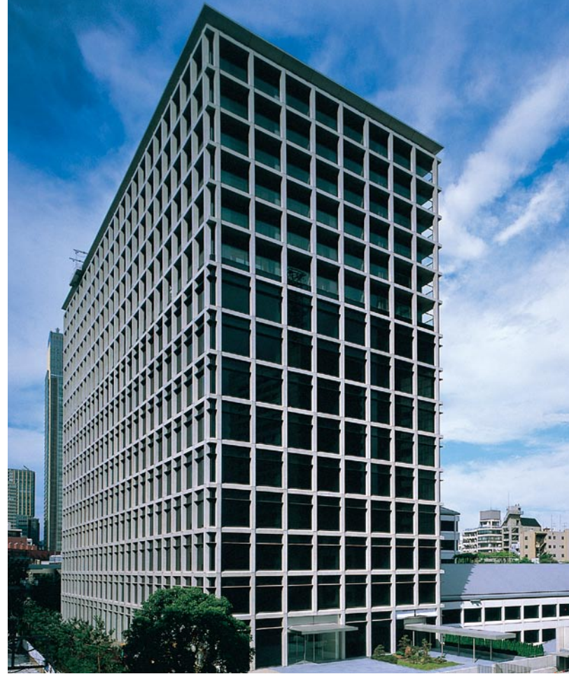
Above: Akasaka Annex