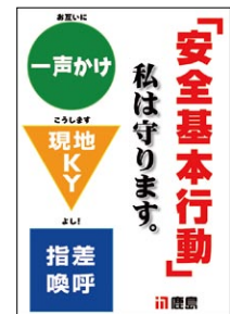
Kajima's Basic Safety Action promotional poster in Japanese

Establishing a safe working environment helps maintain quality and ensure smooth construction schedules, and leads to accident-free project completion. In order to be worthy of the trust placed in the company by customers and society, Kajima works diligently and closely with its subcontractors to implement safety and health management.