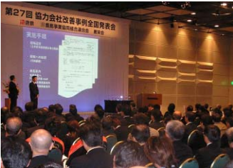
A Kaizen Case Study Presentation Meeting held jointly by Kajima, the Kajima Business Cooperative and Rokueikai. Finalists chosen from regional preliminary meetings present operational improvement ( kaizen ) case studies in a contest designed to contribute to the enhancement of construction standards and encourage an innovative corporate culture.

The Kajima Business Cooperative has mutual aid as its foundation. The Cooperative is involved in management and technical guidance, training programs, the provision of information, and injury prevention programs. It also holds regular meetings at which opinions can be exchanged.