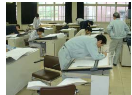
Training carried out at the Fuji Education and Training Center