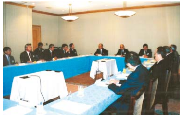
Exchange of frank opinions with Kajima directors and senior employees about the issues they are facing (meetings conducted at Head Office and branches)